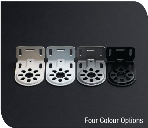
Four Colour Options