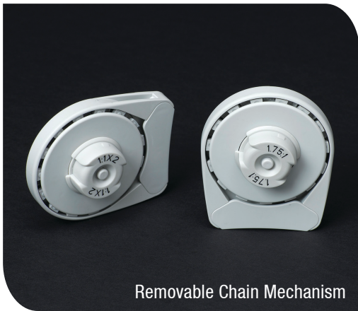
Removable Chain Mechanism